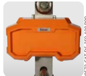
Rugged aluminium diecast enclosure