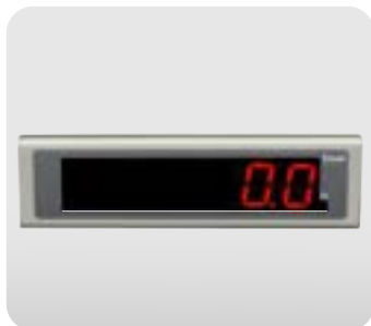
Wireless remote display