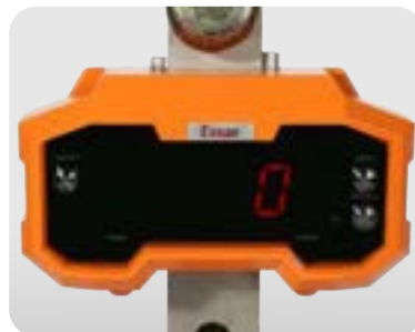
Bright LED display