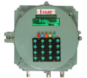
SI-850 FLP Indicator