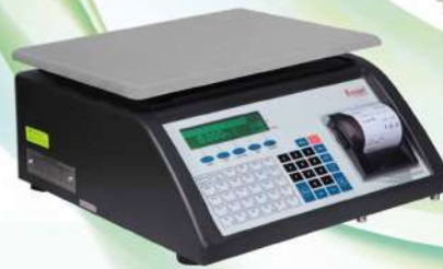
SI-810PR Series Receipt Printing Scale

New generation weighing solution for Retail