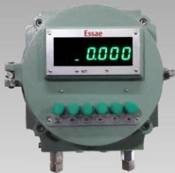
DF-451 Flame Proof (FLP) Console

* Check technical spec doc for further info