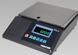
DS-450N Table Top Scale