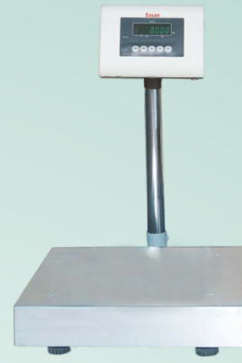
Bench Scale 400 x 400 mm