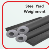
Steel Yard Weighment