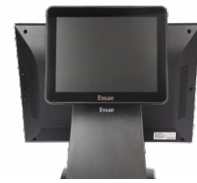
9.7 inch Second display Non-Touch