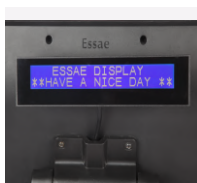
20 chars x 2 lines Customer Display