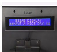
20 chars x 2 lines Customer Display