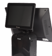
9.7 inch Second display Non-Touch