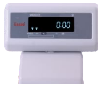
Remote Display (Table)