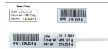
Jewellery Label Tag