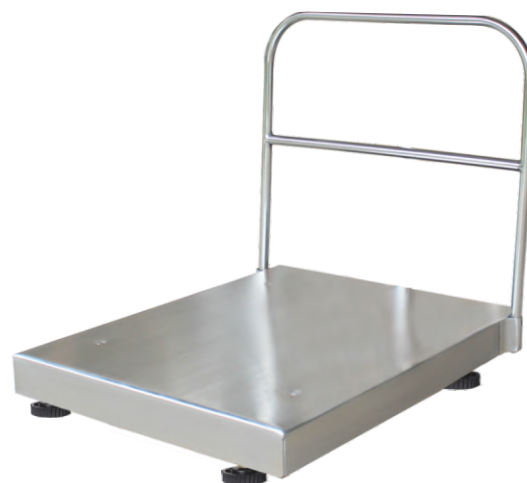
Stainless Steel Platform