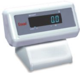
Remote Display (Table)