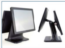
2 nd LCD display supported (Non-Touch)