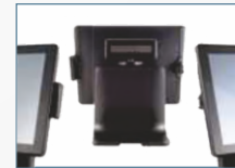
Slim type peripherals MSR, LCM