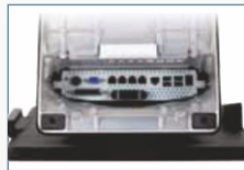
Main board removable for easy service