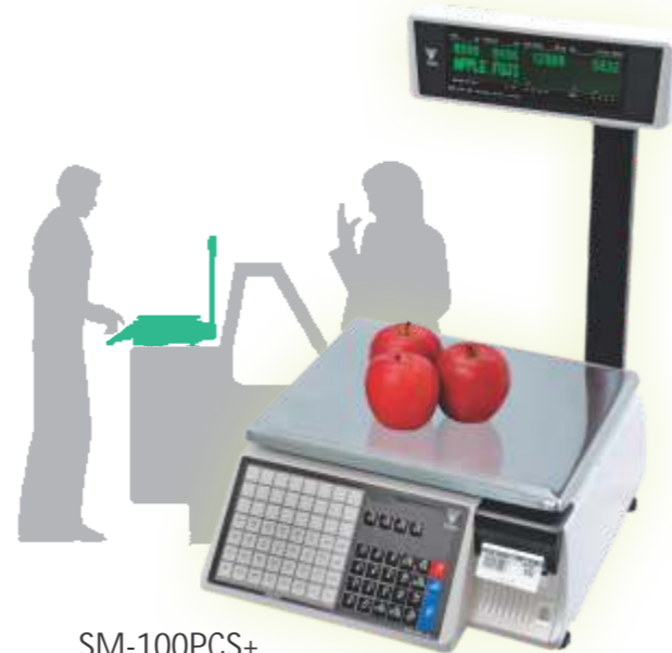
SM-100PCS+ 56 Preset Keys