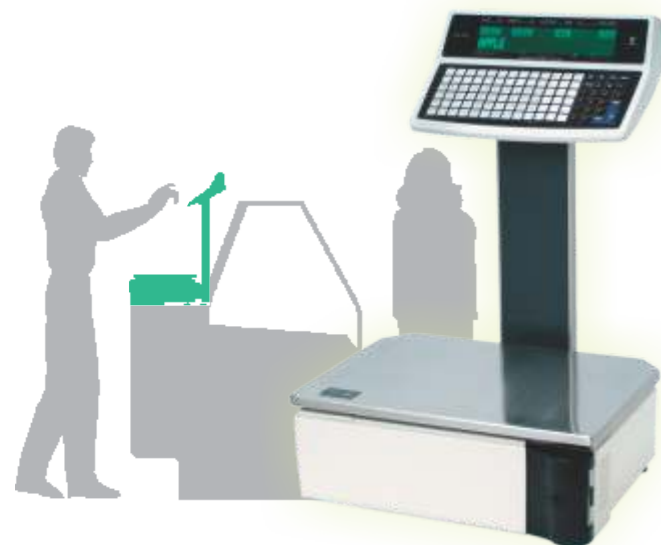
SM-100EV+: Elevated Type 74 Preset Keys