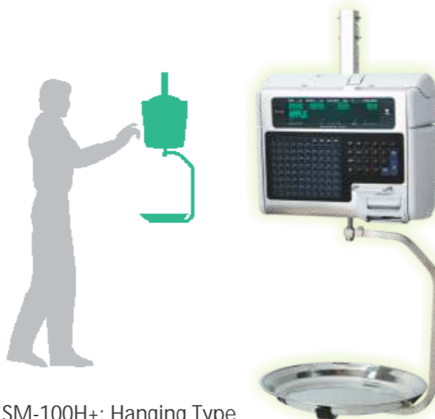
SM-100H+: Hanging Type 76 Preset Keys