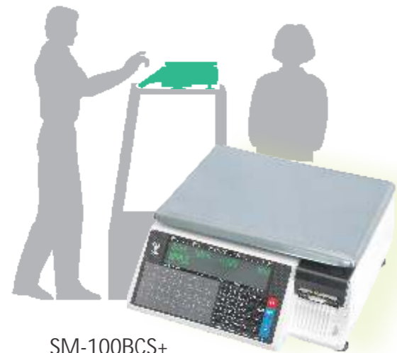
SM-100BCS+ 32 Preset Keys

Weigh quickly and print rapidly to increase throughput. SM-100+ designed to meet the weighing needs of any retail store. This series provides the best value for your store's operation.