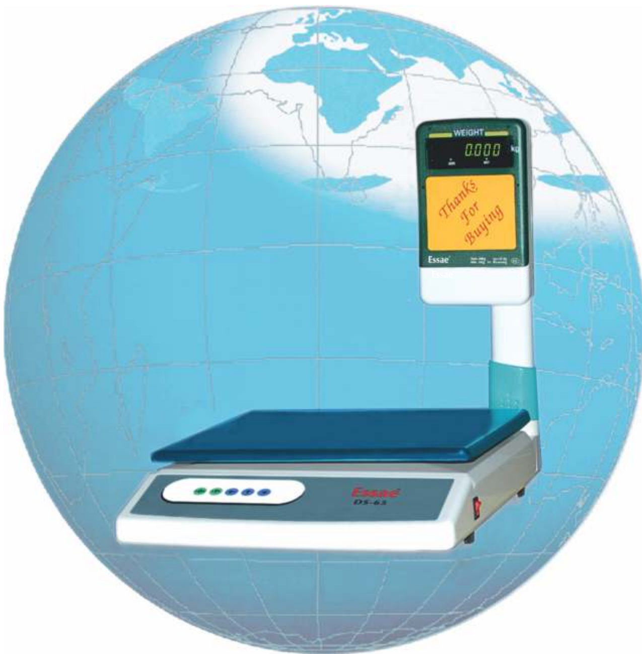
DS-65 Electronic Weighing Scale